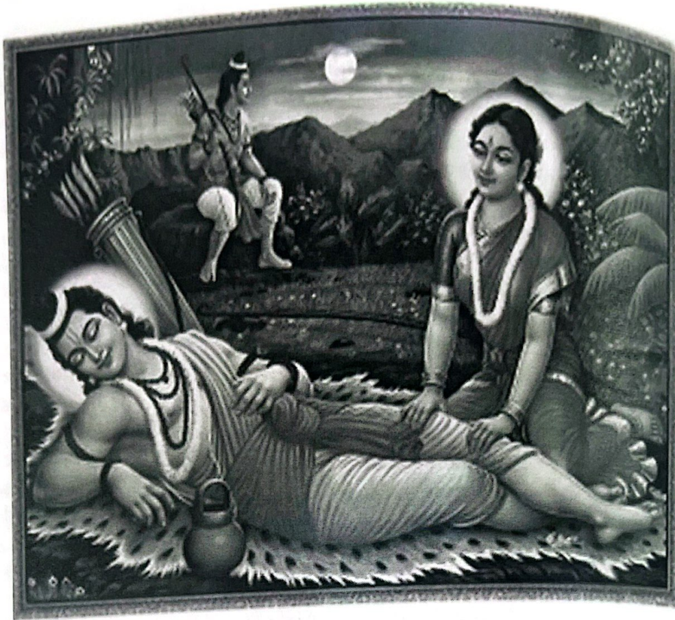
Figure 5-1. A typical image of Princess Sita, shown here, taking care of her husband Ram, having chosen to follow him on his exile, into the forest.